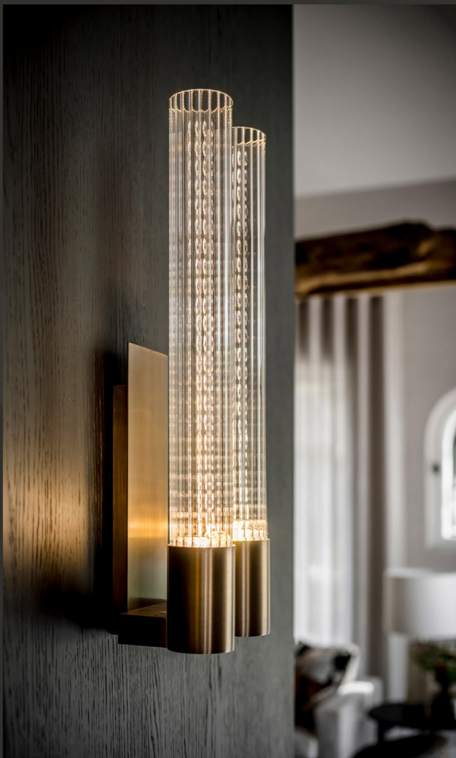
Infinity W2 | Project by Studio La Plume, The Netherlands